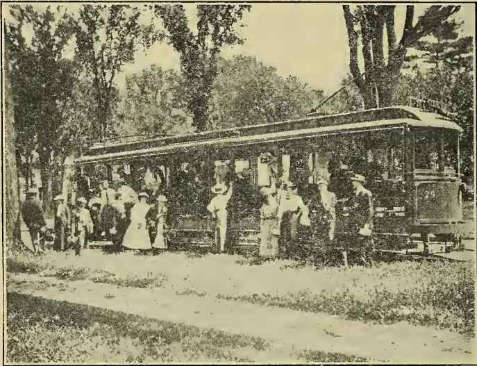
OFF FOR A TROLLY EXCURSION

As far as possible, everyone who registers at the Summer School will be allowed to select his or her own room, either in the College dormitories or outside, and such selections will be offered strictly in the order of registra-